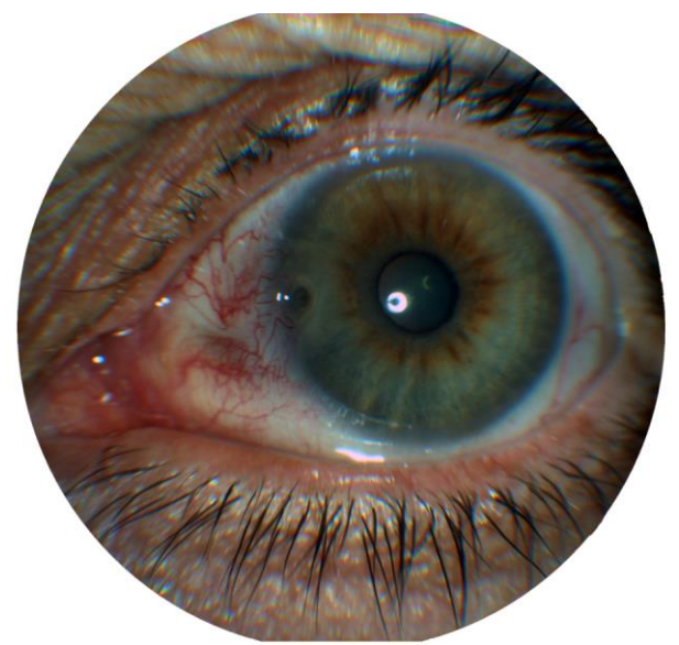
Figure 1. The first appearance of the eye

conjunctiva tissue was excised. The iris prolapse was also excised to prevent infections. Then, viscoelastic material was injected into the anterior chamber. Debridement was applied to the edges of the perforated cornea. With the help of 10/0 monofilament nylon sutures, the autograft was implanted. Viscoelastic material was removed from the anterior chamber.