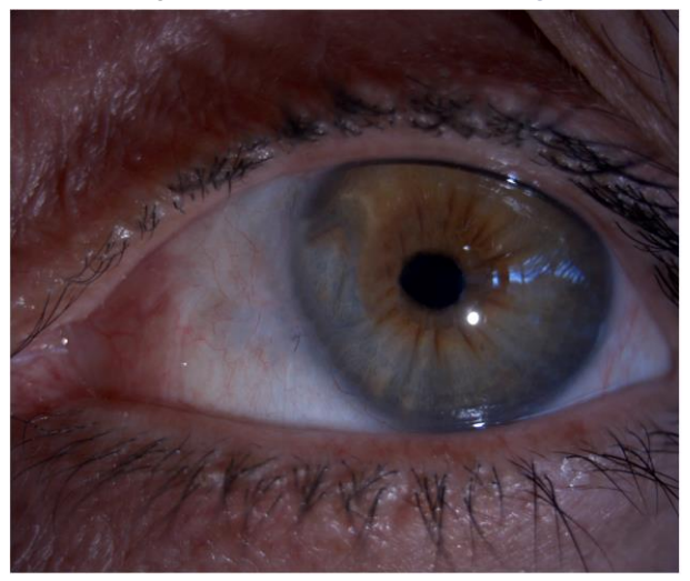
Figure 3. The last appearance of the eye

The patient was examined on the 1st day and 3rd day, and at the 1st week, 1st month, 3rd month and 6th month postoperatively. The healing process did not affect the visual axis. Visual acuity arrived at 0.2 logMAR. In the postoperative period, the patient's cataract, which was present before the operation, progressed. In the postoperative 6th month, a cataract operation was performed. In the postoperative 7th month, the patient's visual acuity was 0.00 logMAR and the perforation region had recovered completely ( Figure 3 ).